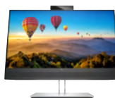
HP E24m G4