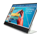
HP E14 Portable Monitor